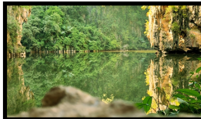
Mirror Lake, Perak