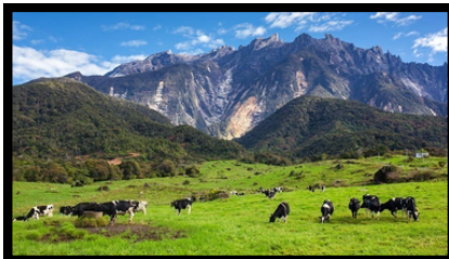
Dairy Castle Farm, Sabah