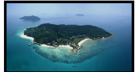
Pulau Besar, Johor